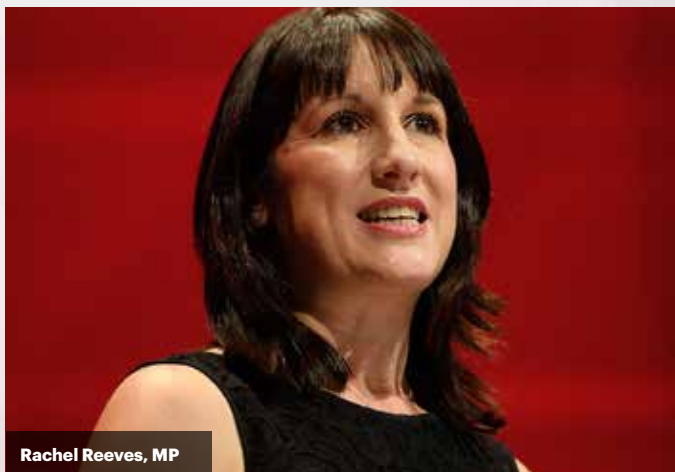
Rachel Reeves, MP