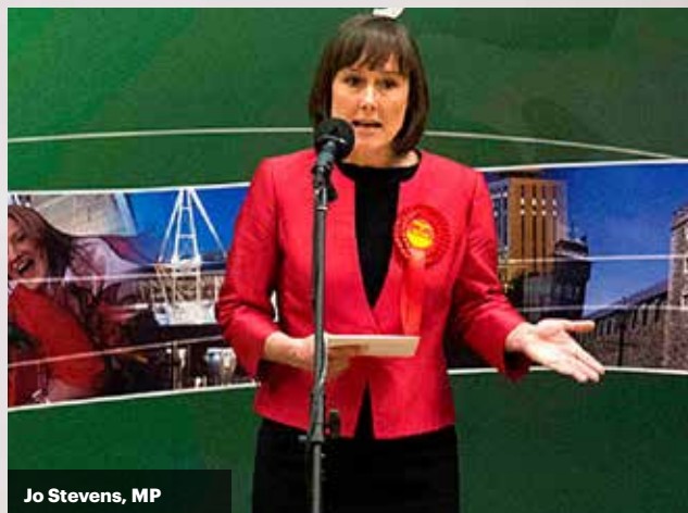
Jo Stevens, MP